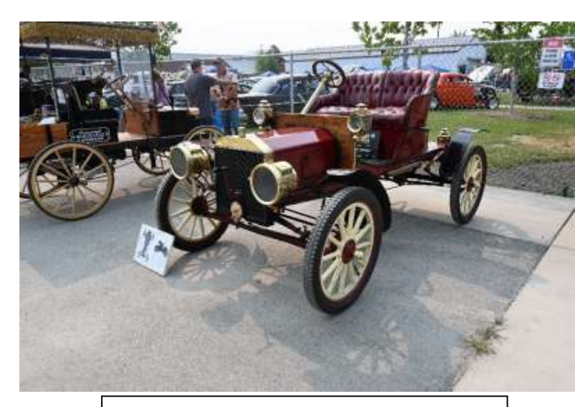
A rare 1907 Ford