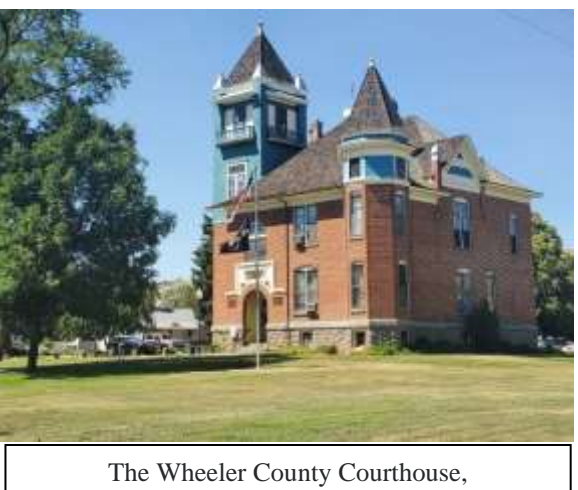
The Wheeler County Courthouse near Fossil Oregon