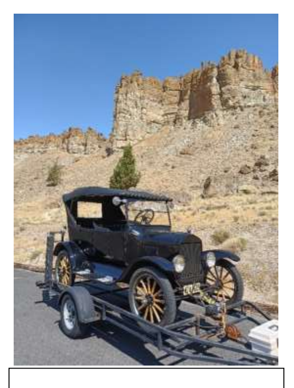
Steven & Debbie Cavalli's model T on trailer somewhere around Fossil, Oregon.