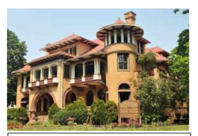
Patsy Clark house, open to the public, was built before the turn of the century.