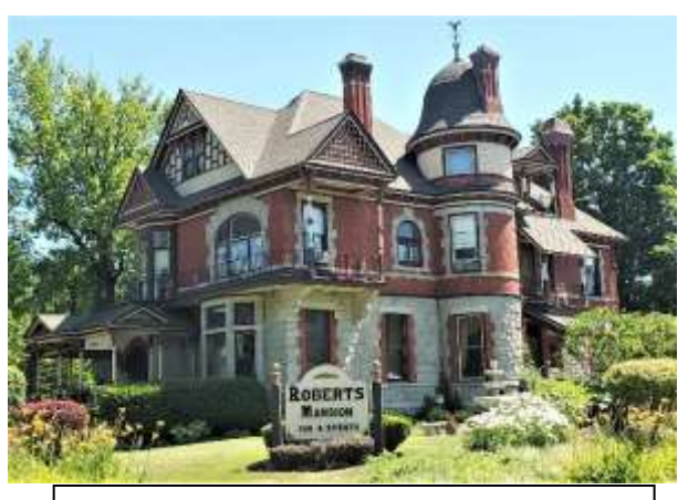
One of Spokane's incredible mansions, now a B&B.

On our tour to Coeur d'Alene, Idaho we saw several beautiful metal sculptures (dandelions above), and on the lawn people were practicing casting for fly fishing.