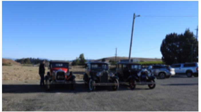
T and A Tour - continued