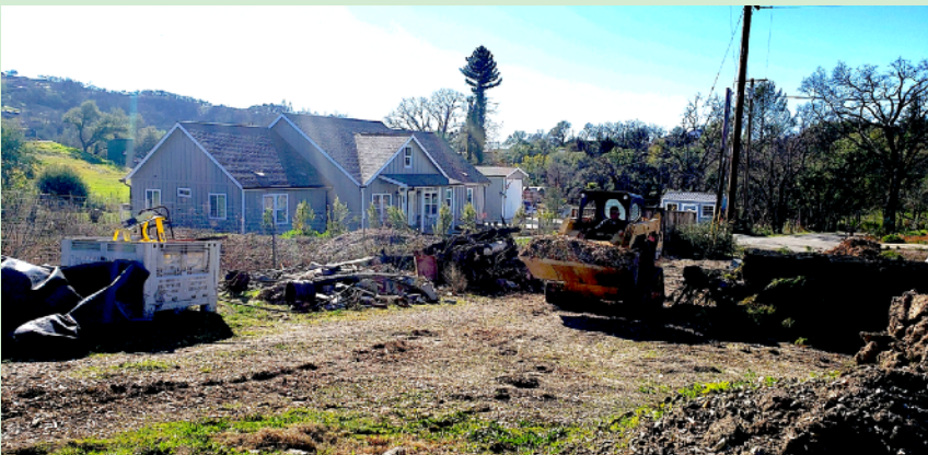
Earl & Dot Holtz