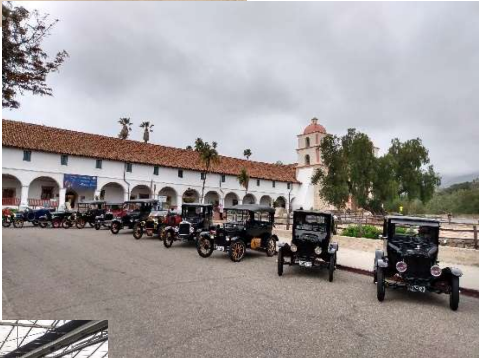
Photo at right: At the Historic Santa Barbara Mission with thirty T-ers, 4 Model T's and one Model A.

started Sunday evening in Ojai , California.