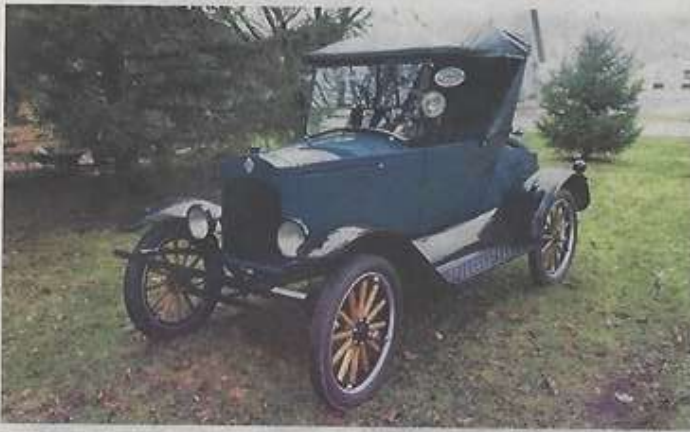
1924 Model T 4-door built over 6 years.