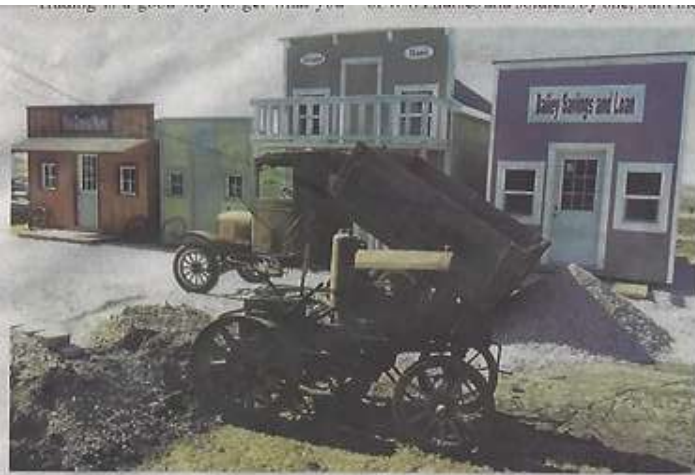
Model Ts fixing Lost Creek Street.