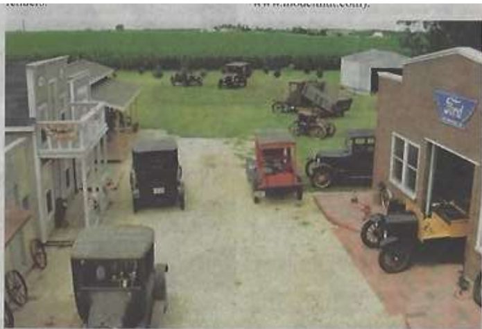
Street scene with Model T dealership.