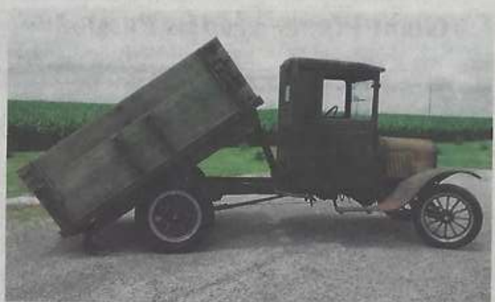
Krug has restored around 20 various Model Ts and has an extensive parts collection.