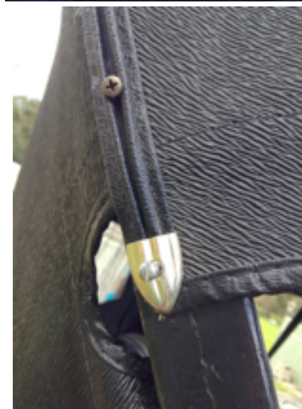
so many tacks, and a few screws too.